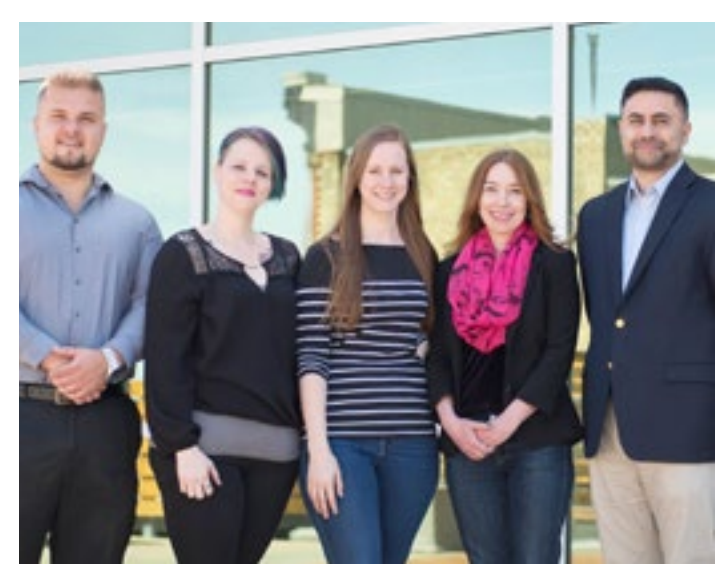
The Donor-Supported Cornerstone Counselling Team

On March 1, 2017, LHSC unveiled a donor-supported pilot project aimed at improving the system of mental health and addiction care for transition age youth (16-25 years). Cornerstone Counselling, as the service is known, is delivered at Youth Opportunities Unlimited (YOU) in partnership with Canadian Mental Health Association-Middlesex, Addiction Services of Thames Valley and mindyourmind.